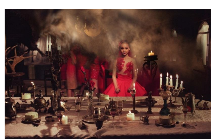
Shen Chaofang Framed, 2011