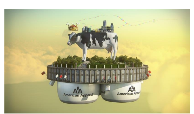
Jonathan Monaghan Mothership, 2013