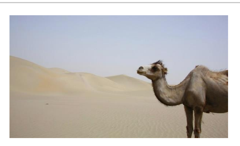
Janet Biggs Point of No Return, 2013