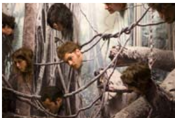
Gilad Ratman The Multipillory , 2010 Video installation Continuous loop

Video 3:00 minutes