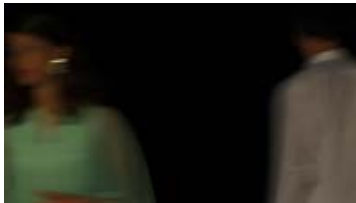
Eve Sussman | Rufus Corporation The Kiss , 2007 HD Video 8:20 minutes Courtesy Impronte Contemporary Art, Milan, Italy