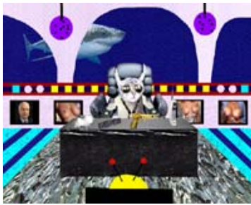
Cameron Platter The Old Fashioned , 2010 Video 12:23 minutes