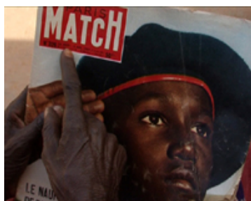
Vincent Meessen Vita Nova , 2009 Video 26:56 min