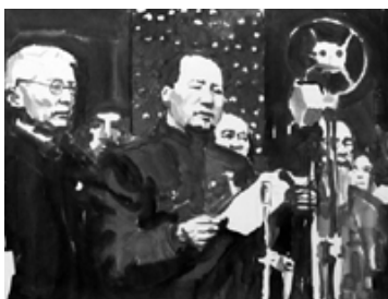
Chen Shaoxiong Ink History , 2010 Video 3:00 minutes