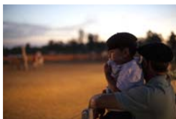
Cao Guimarães Limbo , 2011 Digital HD video 20:30 minutes