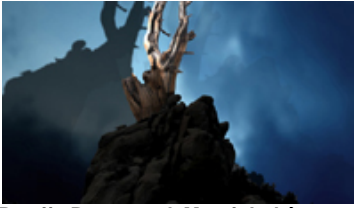
Persijn Broersen & Margit Lukács Mastering Bambi , 2010 HD Video 12:30 minutes

The Lovers , 2010 Video projection/sculpture, wood, carpet 13 minutes