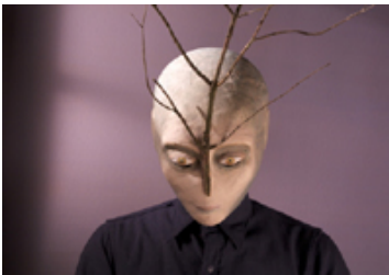
Jonathan Ehrenberg Seed , 2010 Video 6:52 minutes